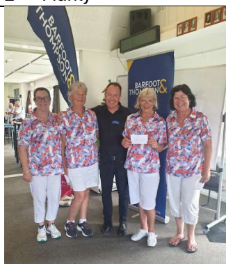
5 th - Warkworth