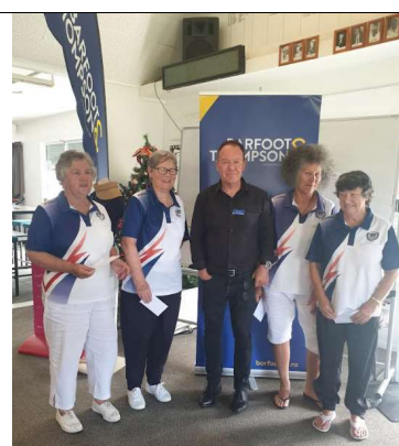
3 rd - Arapohue