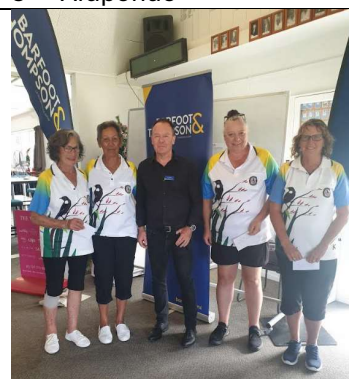
6 th - Ruawai/Mangawhai composite