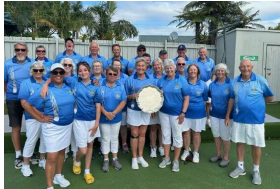
Junior 1-5 Representatives