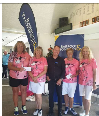
2 nd - Manly