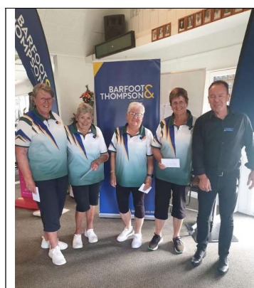
Winners - Mangawhai