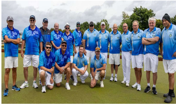
Premier & Development Squad